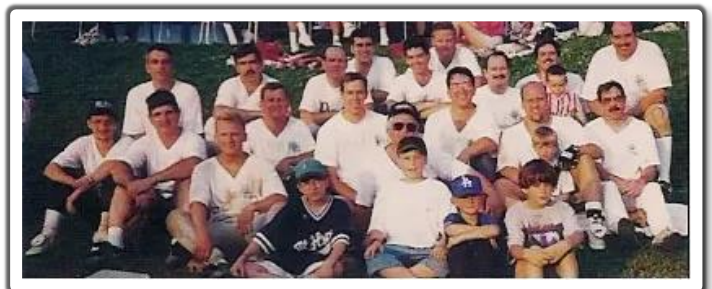
1990s Mt. Hope Men's Softball team

The League of Grace is a church softball fellowship league in the Eastern suburbs of Pittsburgh, PA, whose main goal is to provide an environment to enjoy fellowship with our Christian brothers and sisters as we Celebrate and share our faith as we use our God given talent and skills in a friendly, supportive, yet competitive manor.